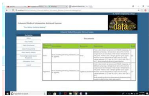
Fig. 4 Screen shot of the proposed system