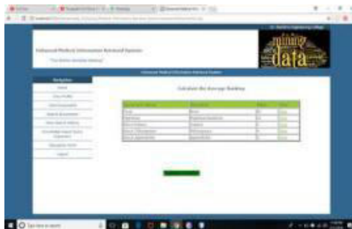
Fig. 3 Screen shot of the proposed system